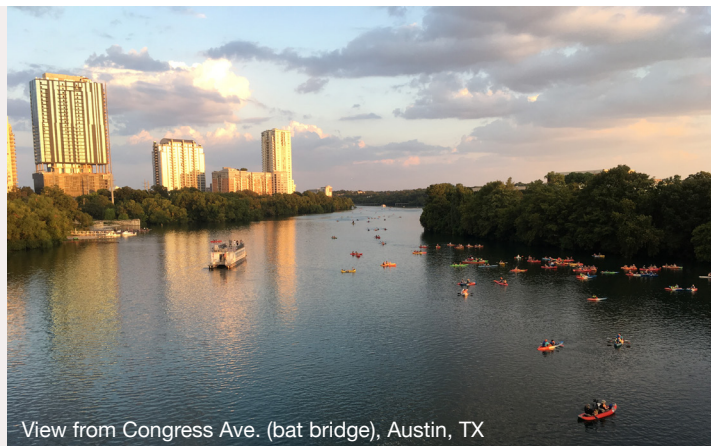
View from Congress Ave. (bat bridge), Austin, TX